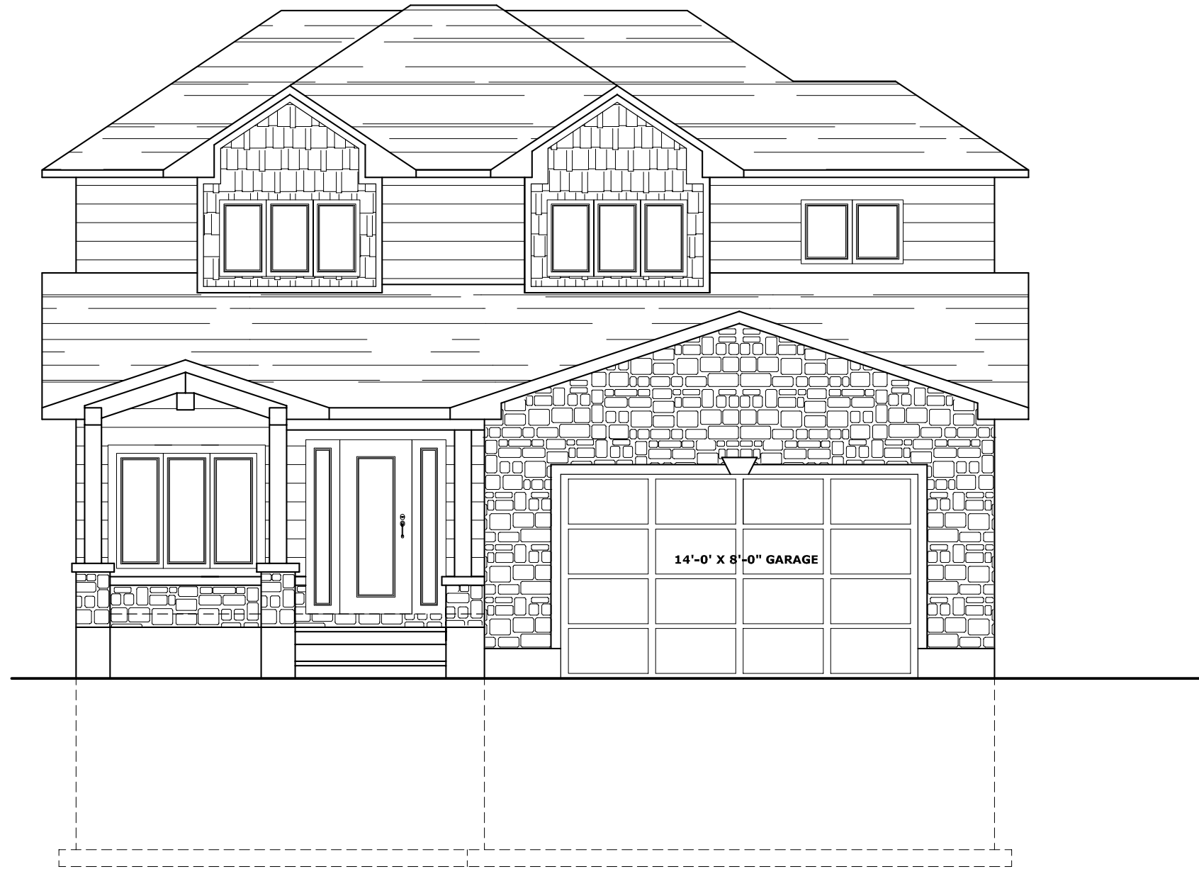
MODEL PRATO FRONT ELEVATION